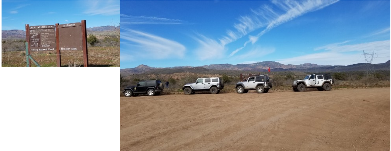
Table Mesa Day Trip - January 27, 2019

Trip Leader: Mike Fissel (SteelPonyCowboy)